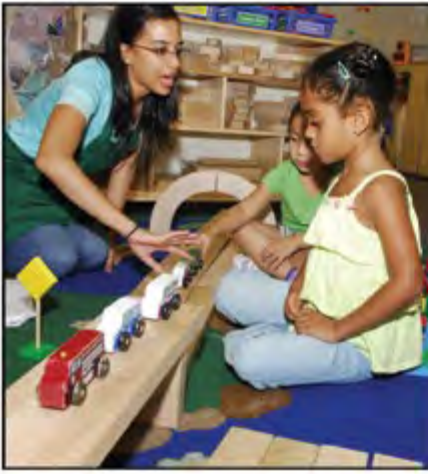
In pre-kindergarten the teacher takes the time to assess the children's knowledge and skills in an authentic setting. "If I take away one car how many do you have? How do you know that?"