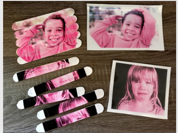
Pencil Case Feeling Puzzles!

sticks for the puzzle pieces. Before laminating each picture, on the back side of it trace the popsicle stick, so you will be able to easily cut them to the shape of the stick. Laminate each picture. Cut the picture in strips to fit the sticks, each stick will make one puzzle piece. Glue each strip of a picture to a stick, keep a copy of the puzzle's picture for children to use as a model of what they are trying to build and have them build their new feeling puzzle!